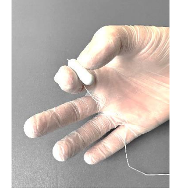
The picture shows the capsule which is similar in size to a vitamin pill and contains a small sponge inside a plant based capsule attached to a piece of strong, thin thread.